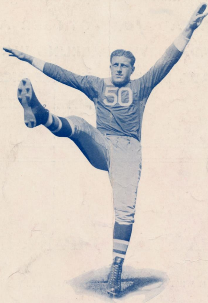
KEN STRONG High Scorer National League, 1933 New York Football Giants