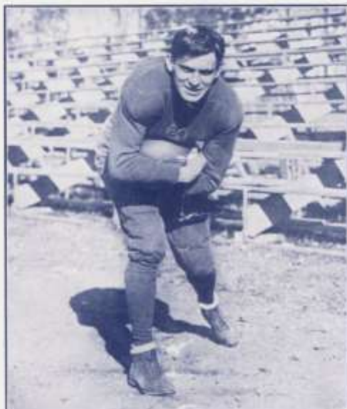
JOHNNY BLOOD Pirates Playing Coach

Tickets for the Pirate game will go on sale tomorrow morning in the office of the New York Football Giants, 11 West 42nd St., Room 1740. We would like to remind you also at this time that if you desire to be sure of your seat locations for the balance of the season it is possible to reserve the same seats for the remaining games when you purchase your seats for the Pirate clash.