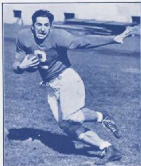
MARSHALL GOLDBERG All-American Back

The current Cardinal array is more powerful than that of a year ago, boasting as it does the addition of Marshall "Biggie" Goldberg, Pitt's famous All-America back who is no stranger to the Polo Grounds.