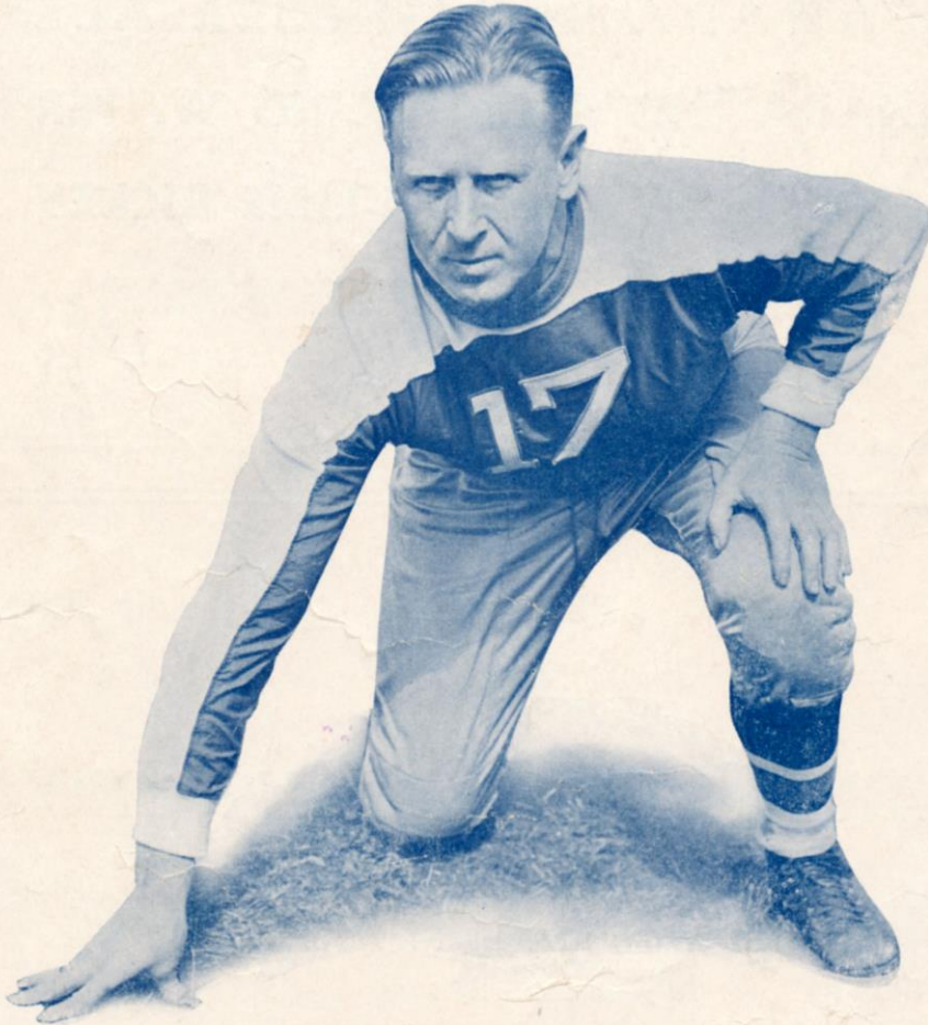
MORRIS "Red" BADGRO All League End 1933 New York Football Giants