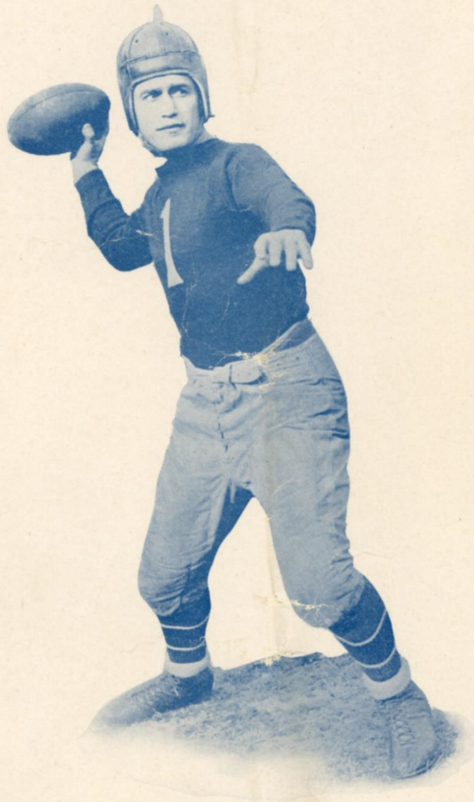
BENNY FRIEDMAN Captain, N. Y. Giants