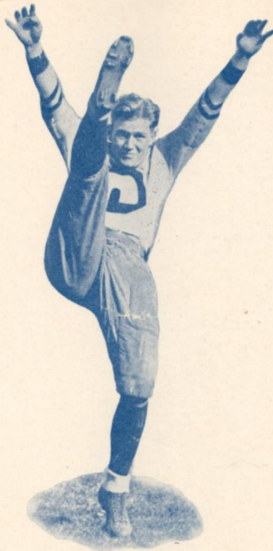
ERNIE NEVERS Captain and Fullback, Chicago Cardinals