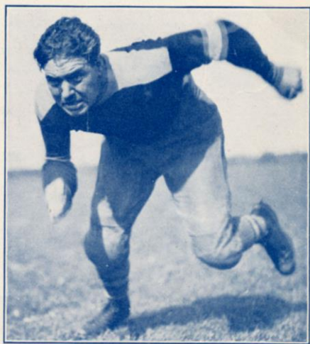
FORREST OLSON "Red" Grange N. Y. Yankees