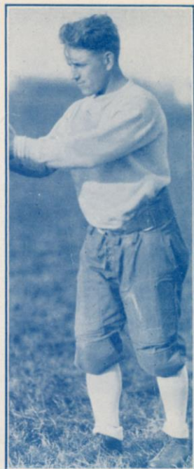
EDDIE TRYON (Colgate) "Red" Grange N. Y. Yankees