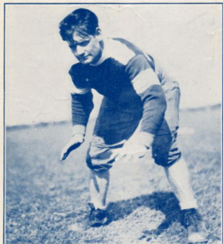
RAY STEPHENS (Idaho) "Red" Grange N. Y. Yankees