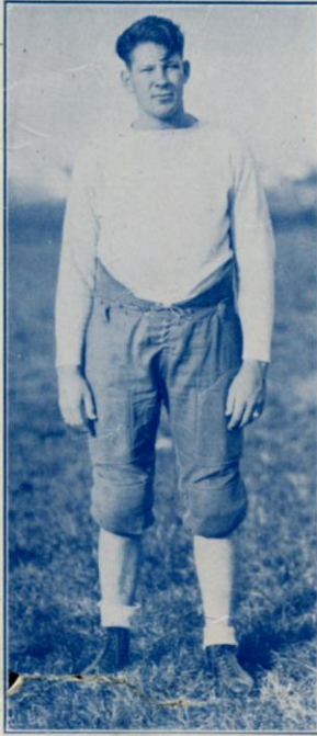
DICK HALL (Illinois) "Red" Grange N. Y. Yankees