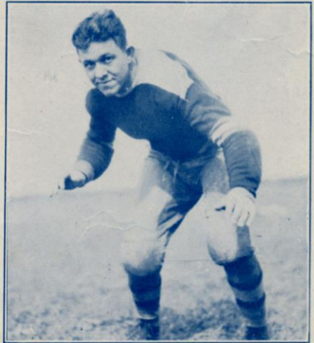
COUNTRY OLIVER (Alabama) "Red" Grange N. Y. Yankees