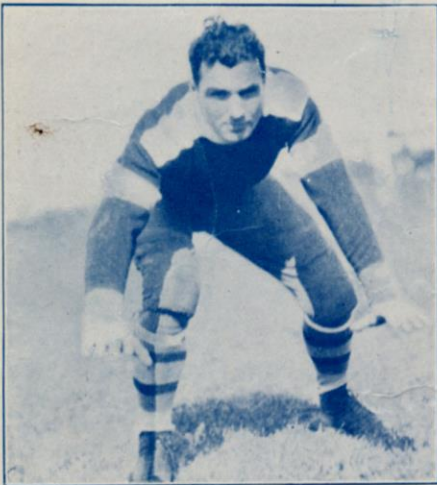
JOHN BAYLEY (Syracuse) "Red" Grange N. Y. Yankees