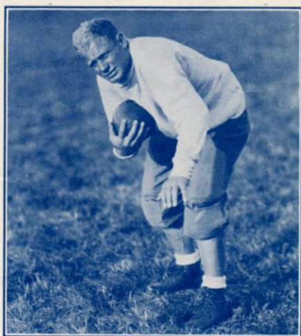
"BULLET" BAKER (So. Calif.) "Red" Grange N. Y. Yankees