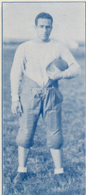
WESLEY FRY (Iowa) "Red" Grange N. Y. Yankees Fullback