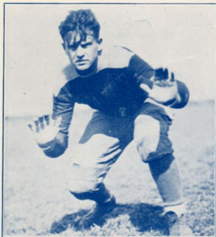
"MUSH" CRAWFORD (Illinois) "Red" Grange N. Y. Yankees