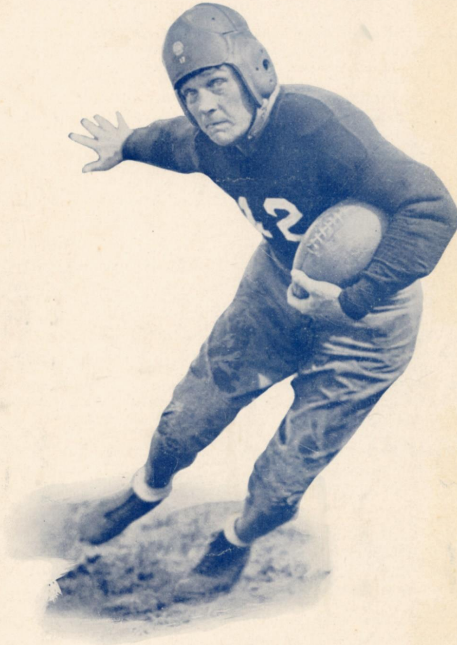
CHRIS. "RED" CAGLE, Giants' Backfield Star

Sunday, Oct. 16, 1932 » Polo Grounds, New York