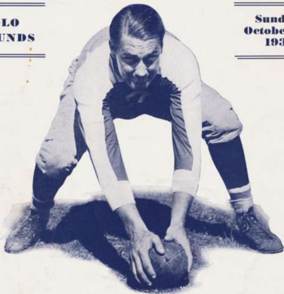
CAPTAIN MEL HEIN New York Giants Center All-League pivot past four years

Sunday, October 31, 1937, Kickoff 2:30 P.M. AT POLO GROUNDS NEW YORK GIANTS vs. CHICAGO BEARS