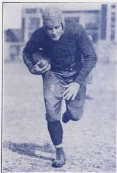
BRONKO NAGURSKI Chicago Bears Fullback

Why not assure yourself of the same seat for the balance of the Giant schedule too by requesting to have seats put aside for you every week. Starting with the Bears next week the Giants will face the Pirates, Detroit Lions, Green Bay Packers and Washington Redskins. That's truly an attractive array so when you buy your Bear tickets just request that the same seats be held for you each Sunday.