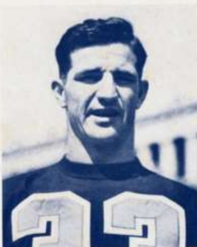
SAMMY BAUGH Redskins' Ace Passer

Gaining that playoff looks even tougher today than it did two months ago for at that time the Redskins had not walked through all opposition and set new high marks in offensive achievements. Now the Washington team comes to the Polo Grounds favored to turn back the Giants and it would seem with good reason if comparative performances mean anything in football.