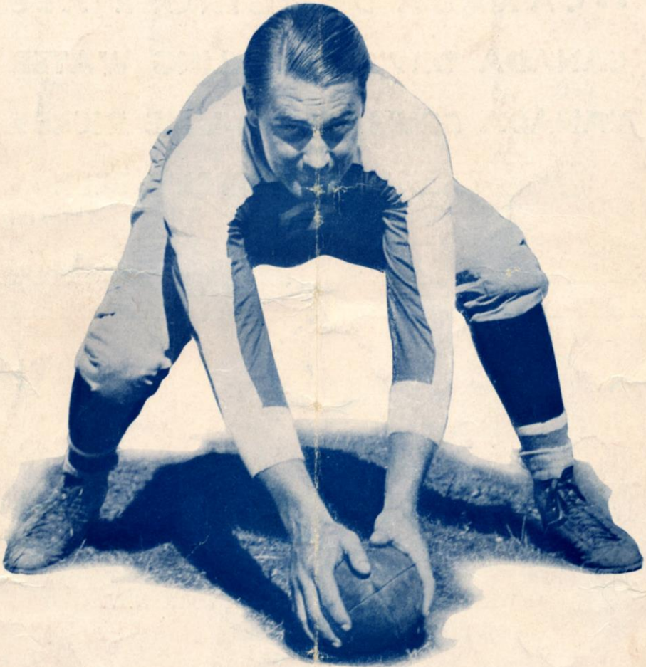
MEL HEIN All-League Center New York Football Giants