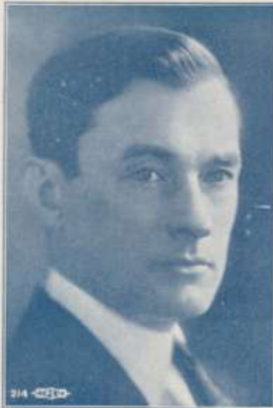
Senator JAMES J. WALKER

Regular Democratic Candidate FOR MAYOR OF NEW YORK