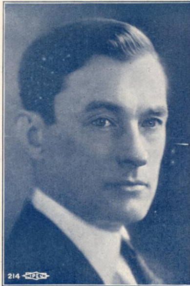
Senator JAMES J. WALKER

Regular Democratic Candidate FOR MAYOR OF NEW YORK