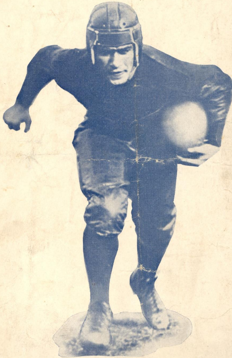
BENNY FRIEDMAN Captain, N. Y. Giants