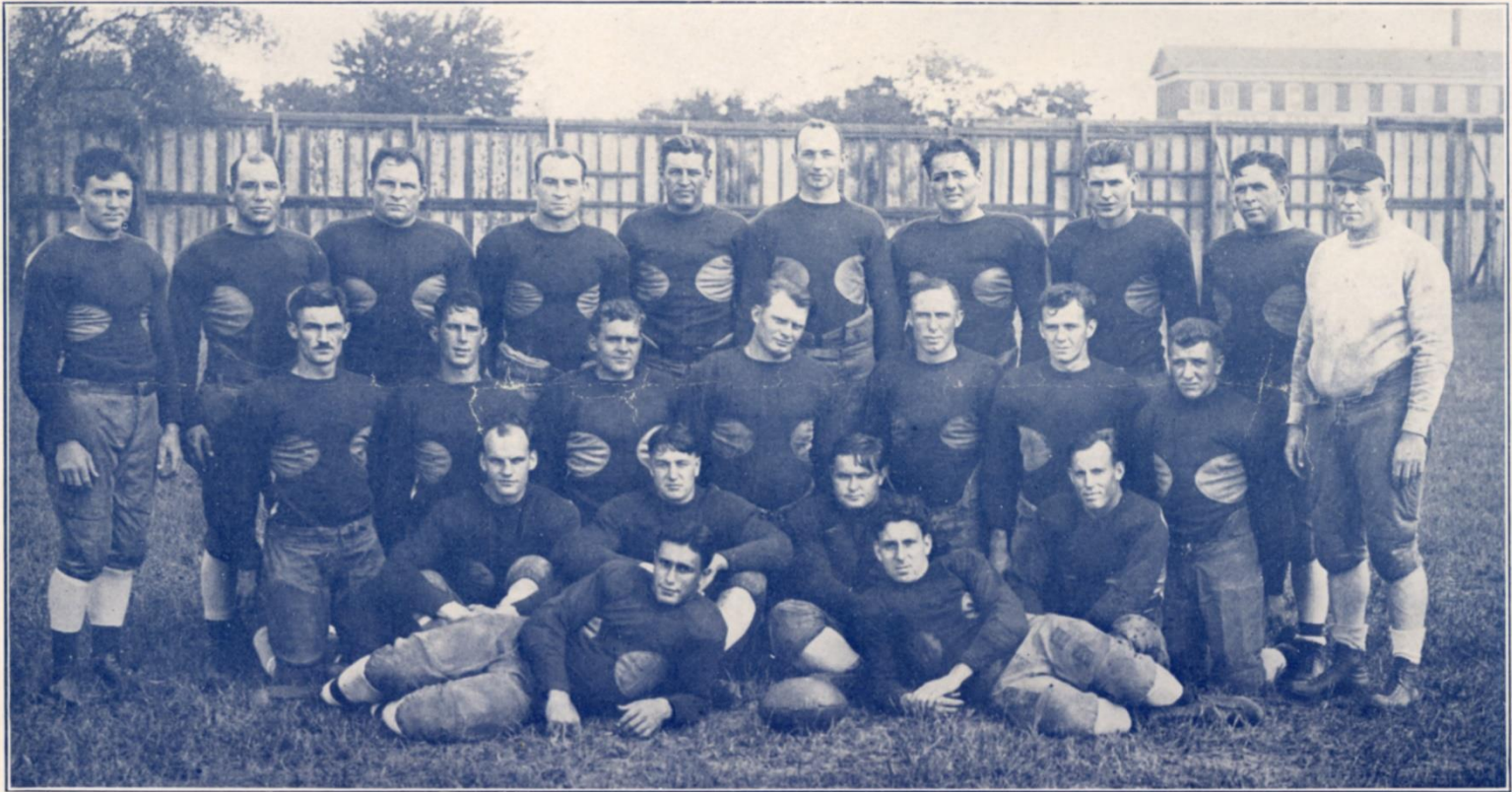
N. Y. FOOTBALL GIANTS SQUAD FOR 1929