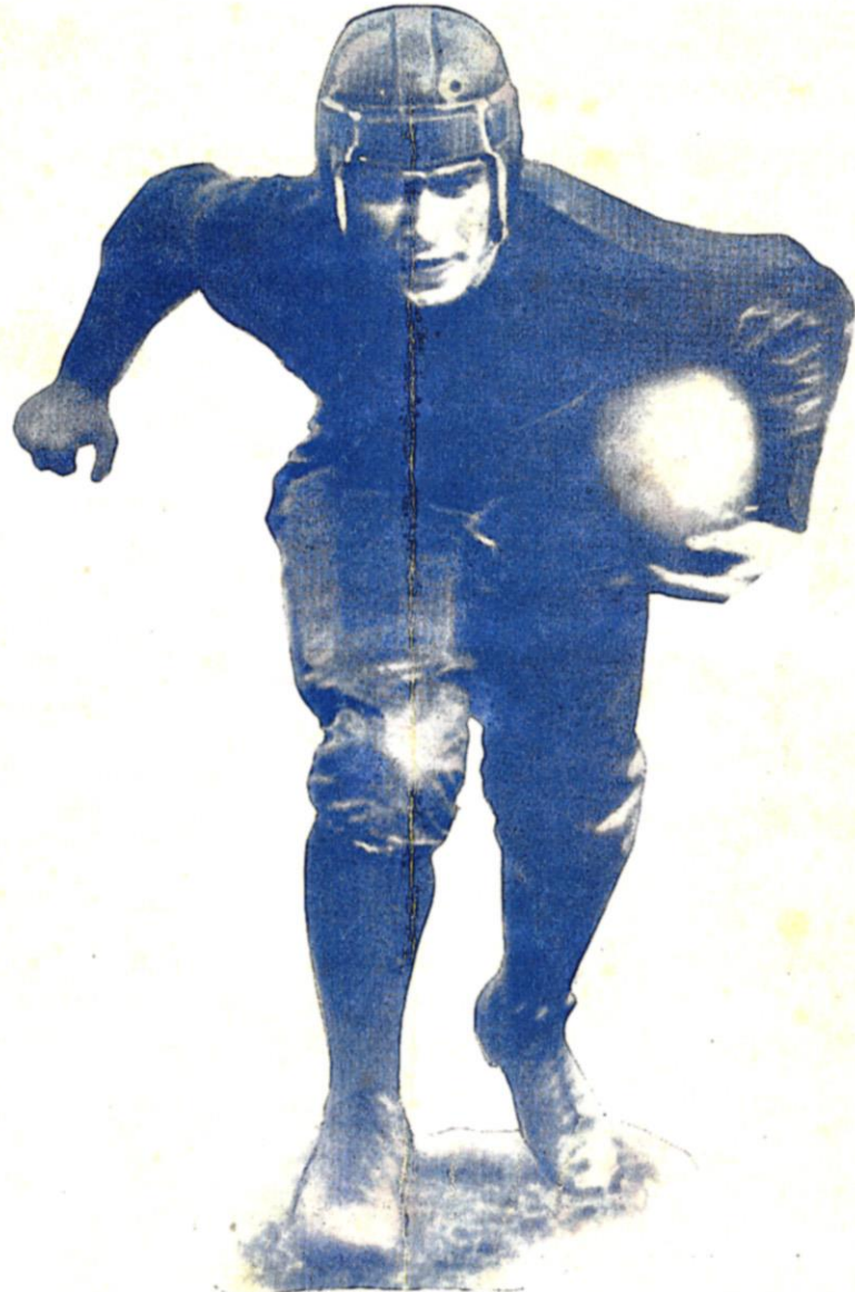
BENNY FRIEDMAN Captain, N. Y. Giants