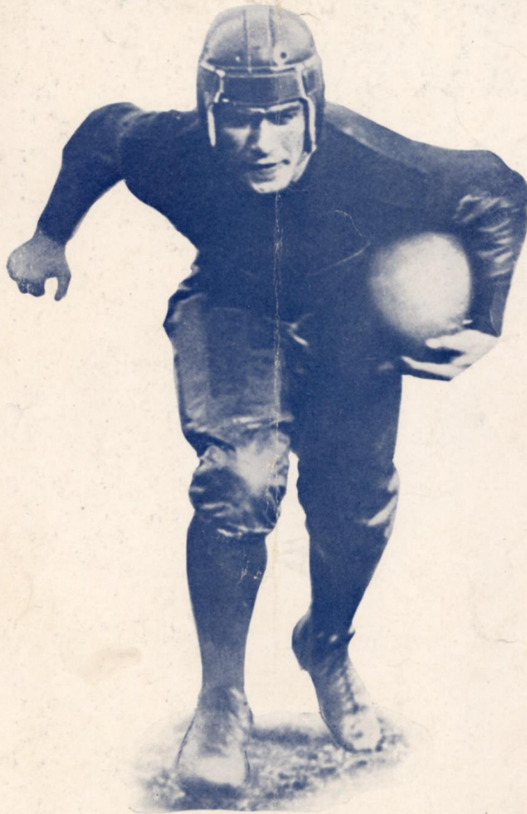
BENNY FRIEDMAN Captain, N. Y. Giants