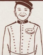
Crawling or pushing, 5 yards; helping ball carrier, 15 yds.