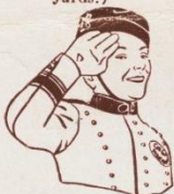
Unnecessary roughness, clipping, or roughing the kicker. (Penalty, 15 yards and possible disqualification.) Running into kicker. (Penalty, 5 yards.)