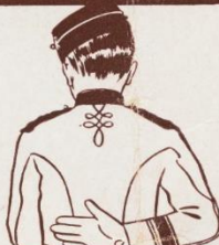
Illegal forward pass. (Penalty 5 yards.)