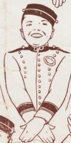
Penalty refused, incomplete pass, missed field goal or conversion, both sides offside, etc.