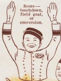
Score—touchdown, field goal, or conversion.