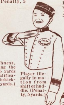
Player illegally in motion from shift or huddle. (Penalty, 5 yards.)