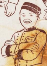
Extra time-outs. (Penalty, 5 yds.) Delay of game. (Penalty, 15 yds.)