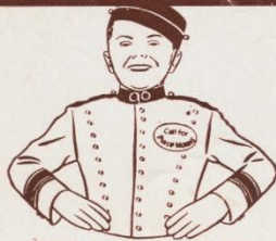
Offside or violation of kick-off formation. (Penalty, 5 yards.)