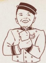
Holding. (Penalty—by offense, 15 yards; by defense, 5 yards.)