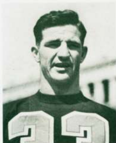
SLINGIN' SAMMY BAUGH