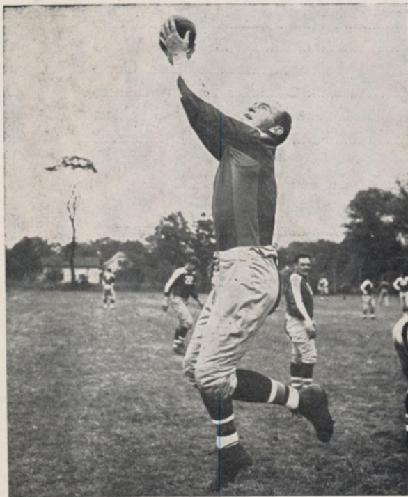
RAY FLAHERTY . . NEW YORK GIANTS . . END

As a result of the interest shown by the fans