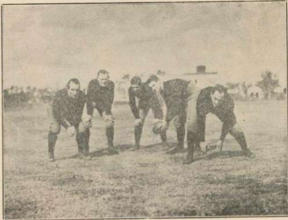
COLLEGIAN'S BACK FIELD