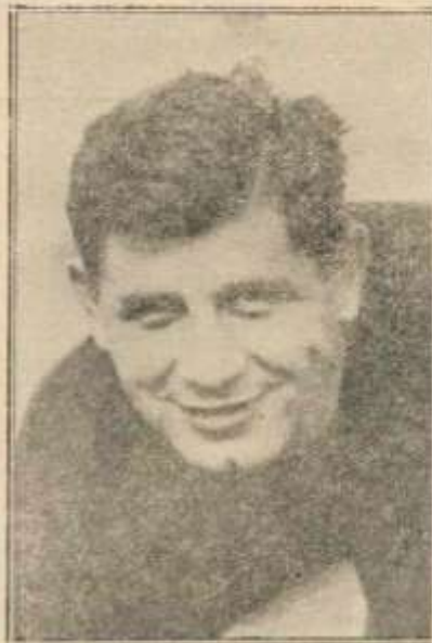
SPAGNA, Left Guard