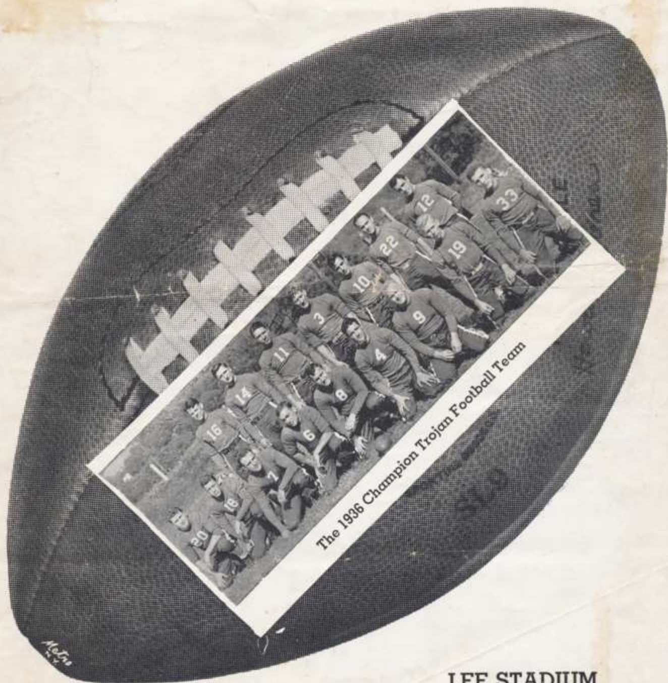
The 1936 Champion Trojan Football Team