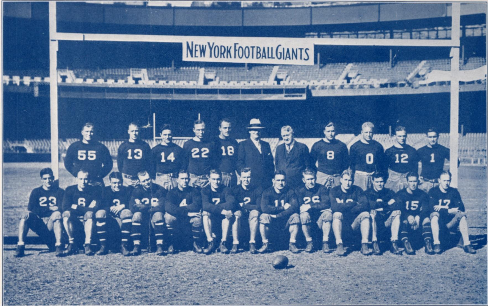
NEW YORK FOOTBALL GIANTS SQUAD OF 1931