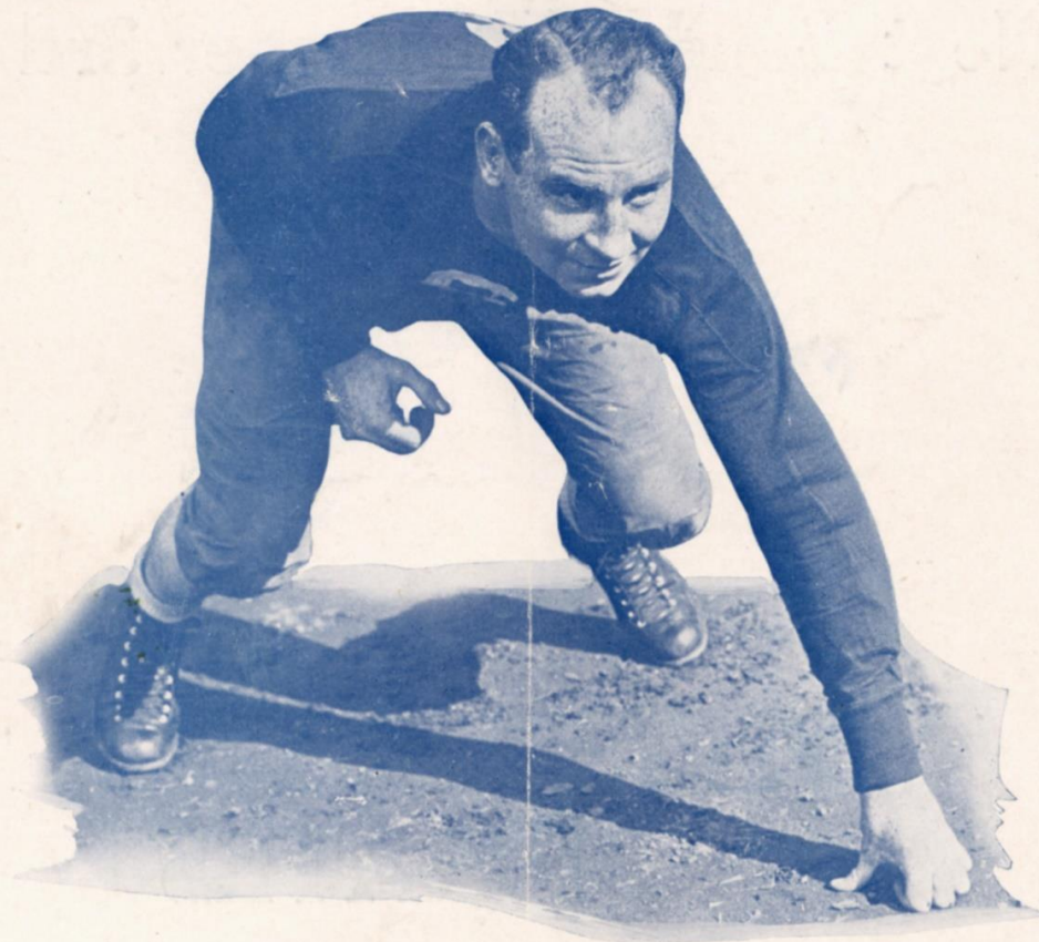
RAY FLAHERTY Captain and Assistant Coach of Giants