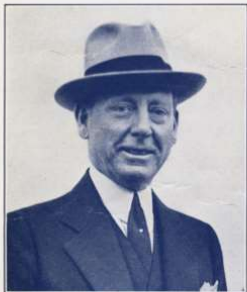
HON. FRANK HAGUE