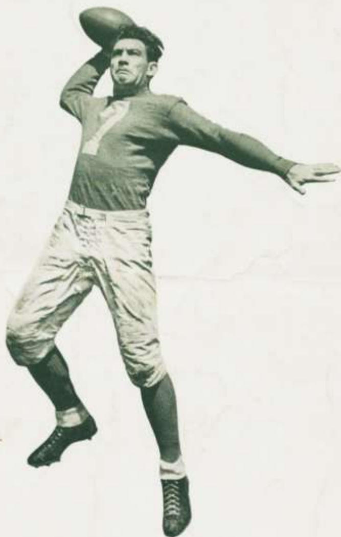
ACE PARKER Dodgers' Spark Plug

EBBETS FIELD Thursday Night - September 14, 1939