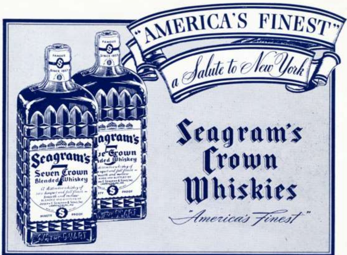
SEAGRAM'S 5 CROWN BLENDED WHISKEY. 90 Proof. 72½% neutral spirits distilled from American grains. SEAGRAM'S 7 CROWN BLENDED WHISKEY. 90 Proof. 60% neutral spirits distilled from American grains. Seagram-Distillers Corp., Offices: New York