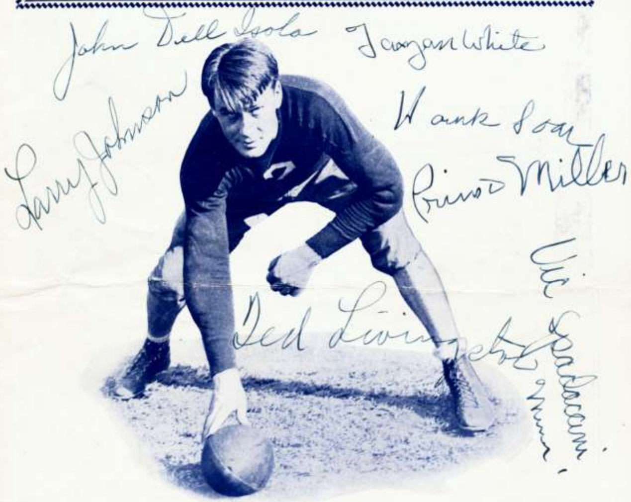
"Mel" HEIN, Giants Captain

POLO GROUNDS — Sunday, November 13, 1938