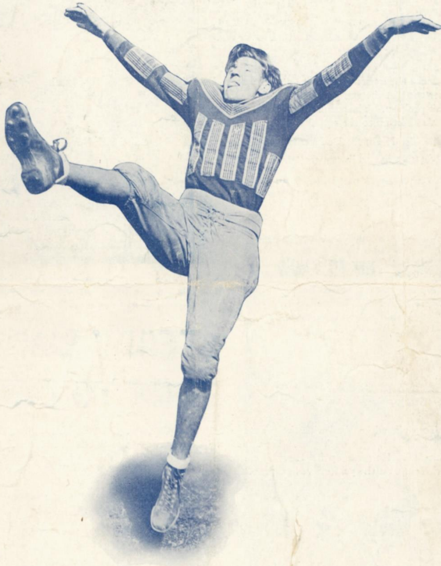
JOHN SIMMS "Shipwreck" KELLY Brooklyn Dodgers