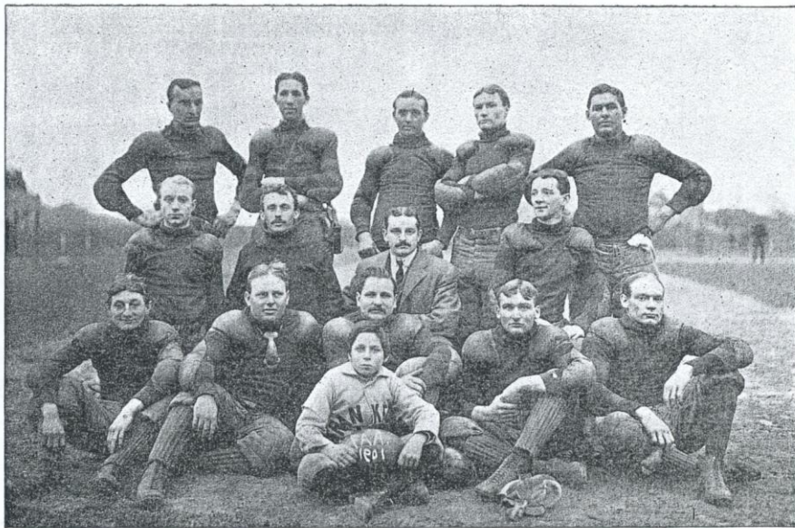
Foot Ball Team 1901