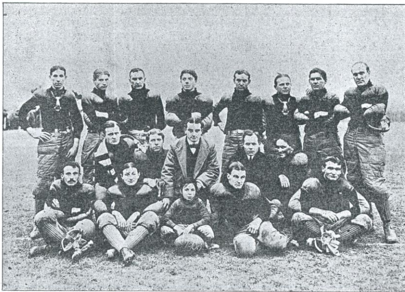
Foot Ball Team 1900