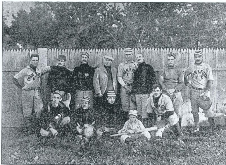
Base Ball Team 1899