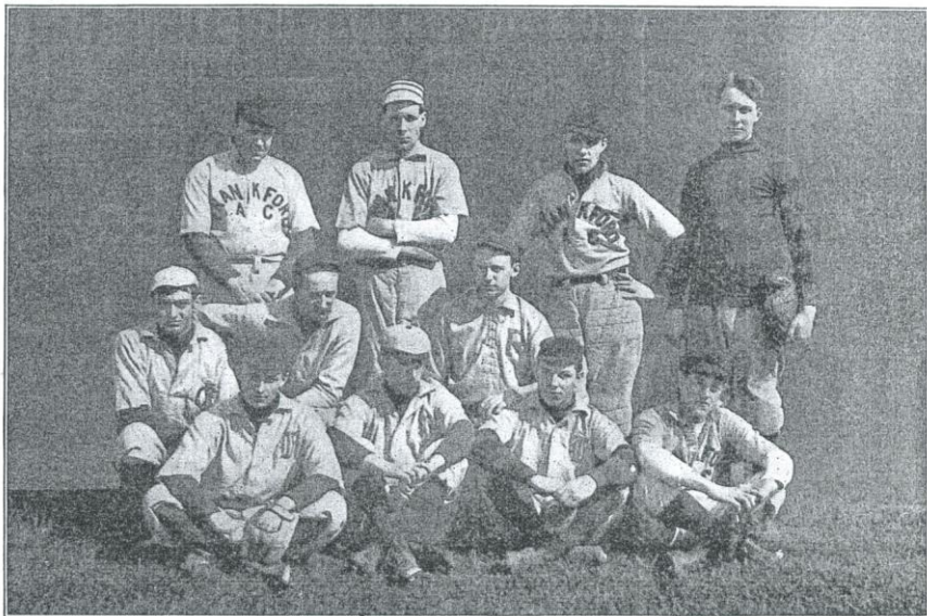
Base Ball Team 1904

Purnell and Poulterer were not present when photograph was taken.