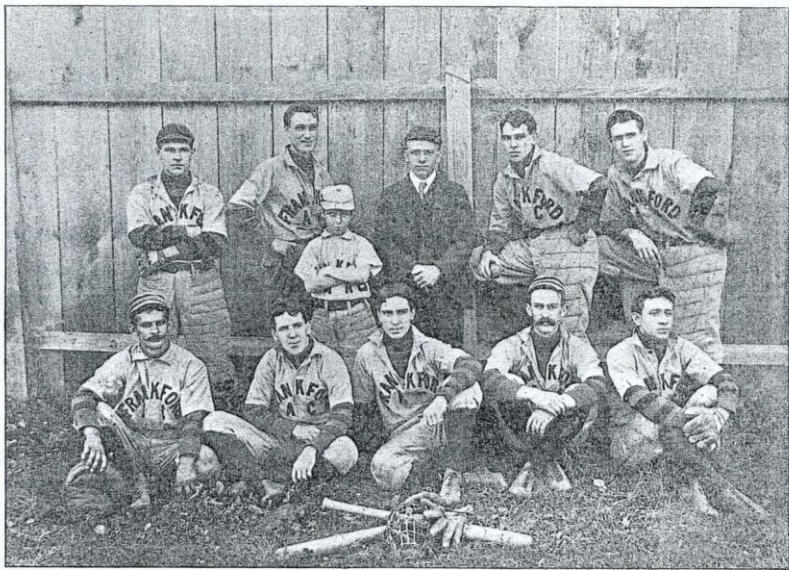
Base Ball Team 1900