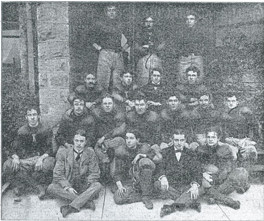
Foot Ball Team 1899