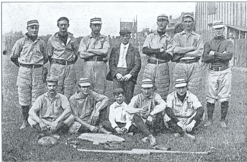
Base Ball Team 1902