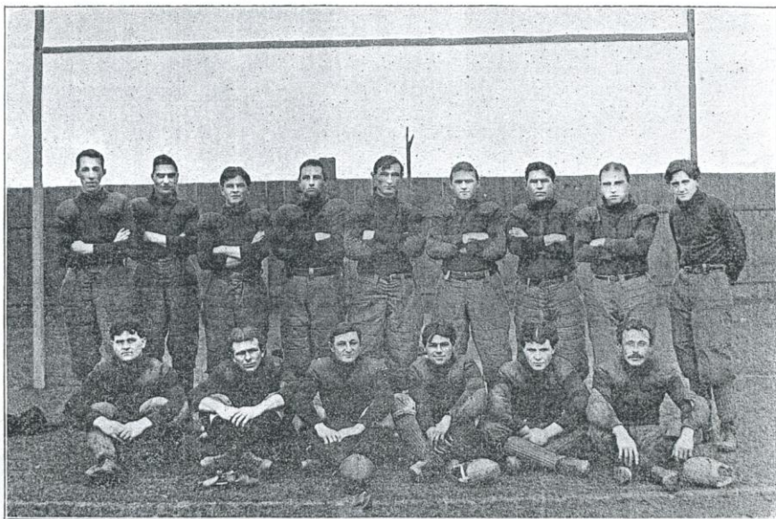
Foot Ball Team 1904