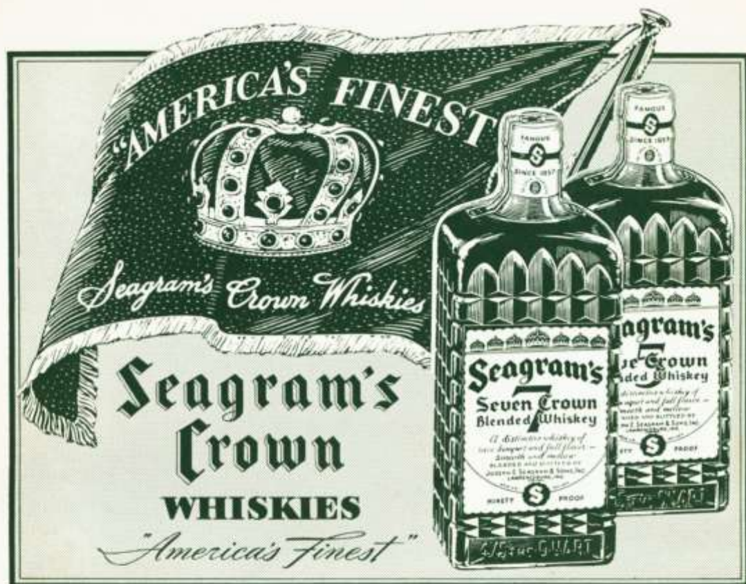
SEAGRAM'S 5 CROWN BLENDED WHISKEY. 90 Proof. 72½% neutral spirits distilled from American grains. SEAGRAM'S 7 CROWN BLENDED WHISKEY. 90 Proof. 60% neutral spirits distilled from American grains. Seagram-Distillers Corp., Offices: New York