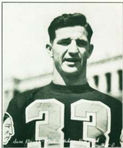
SLINGIN' SAMMY BAUGH