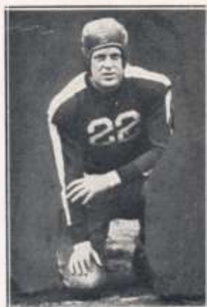
GEORGE PALMERS Center New York University

SAME MANAGEMENT AS CANTON RESTAURANT OF NEWARK