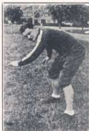
AL KANYA Tackle